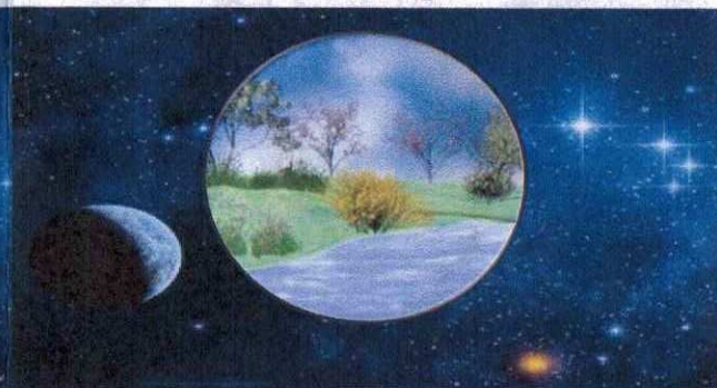
Seas and Dry Land

"God said, Let the waters under the heaven be gathered together unto one place, and let the dry land appear : and it was so. (9)