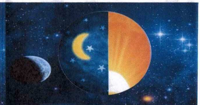
Sun, Moon, Stars Brought Back, As Before the Original Creation In Job 38:3-7

"God said, Let there be lights in the firmament of the heaven to divide the day from the night; and let them be for signs, and for seasons, and for days, and years: (14)