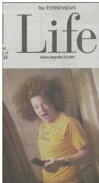
In November, 2004, a sexually confused young man decided he wanted to become the prom queen at Vanderbilt University in Nashville, Tennessee. The local newspaper featured this man in its Sunday edition and portrayed him as being perfectly normal.